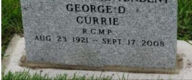
UPRIGHT GRANITE HEADSTONE 76.2 cm high 45.72 cm wide 7.62 cm thick