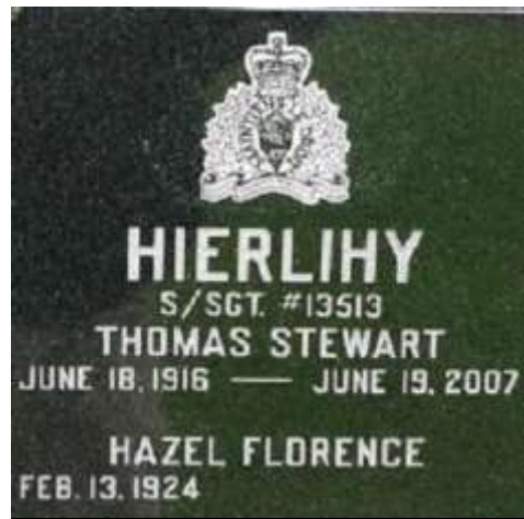
Niche Plate with Member and Spouse