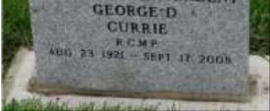
UPRIGHT GRANITE HEADSTONE 76.2 cm high 45.72 cm wide 7.62 cm thick