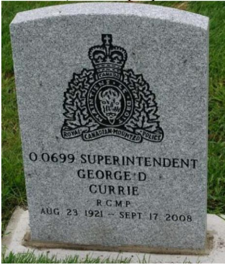
UPRIGHT GRANITE HEADSTONE 76.2 cm high 45.72 cm wide 7.62 cm thick

All bear the RCMP crest, member's name, rank, regimental number, date of birth and date of death (see example photo's below).