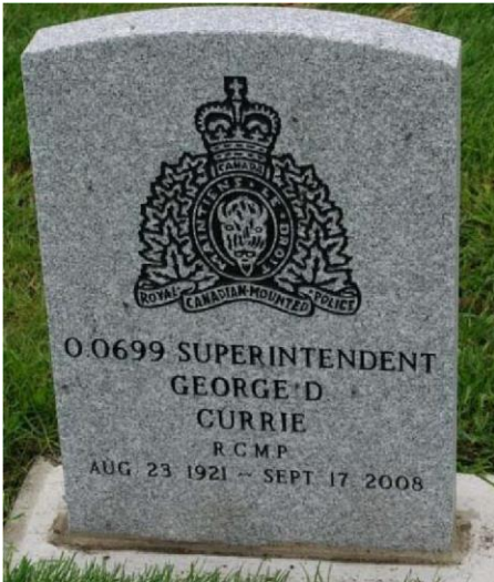
UPRIGHT GRANITE HEADSTONE 76.2 cm high 45.72 cm wide 7.62 cm thick