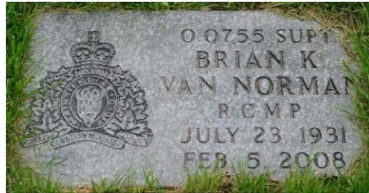
FLAT GRANITE MARKER 50.8cm wide 30.48cm high 7.62cm thick