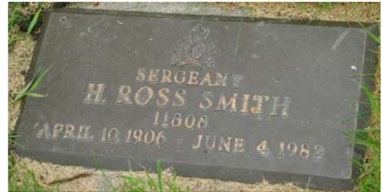
FLAT BRONZE MARKER 60.96cm wide 30.48cm high .635cm thick INSCRIPTION RAISED .32 cm