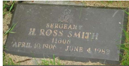
FLAT BRONZE MARKER 60.96cm wide 30.48cm high .635cm thick INSCRIPTION RAISED .32 cm